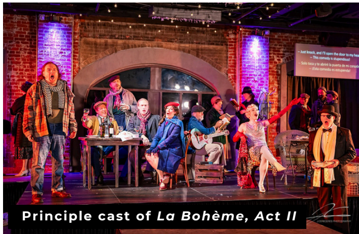
Principle cast of La Bohème , Act II