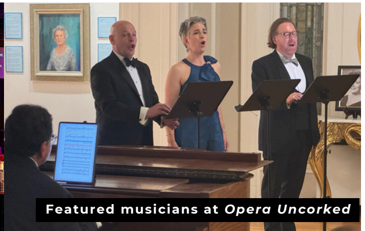
Featured musicians at Opera Uncorked